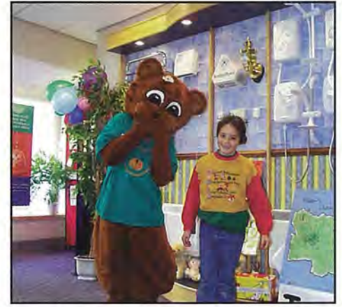
If you go down to the Customer Services Centre you're sure of a big surprise... staff at Aberystwyth CSC staged a Teddy Bear's Picnic to the delight of their young customers.

were asked to donate pennies into a picturesque "wishing well."