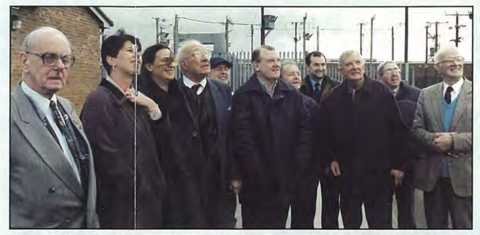
Pensioners from the Wirral community enjoying a day out visiting Hoylake 132 substation.

At the Whitechapel Centre, a day centre providing services to people who are homeless or in danger of becoming so, Christmas Challenge volunteers delivered and set up a Christmas tree with decorations.